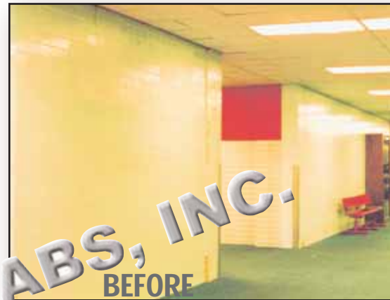
6500 SQ. FT. OF TILE AT A SCHOOL