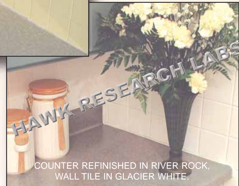
COUNTER REFINISHED IN RIVER ROCK, WALL TILE IN GLACIER WHITE.