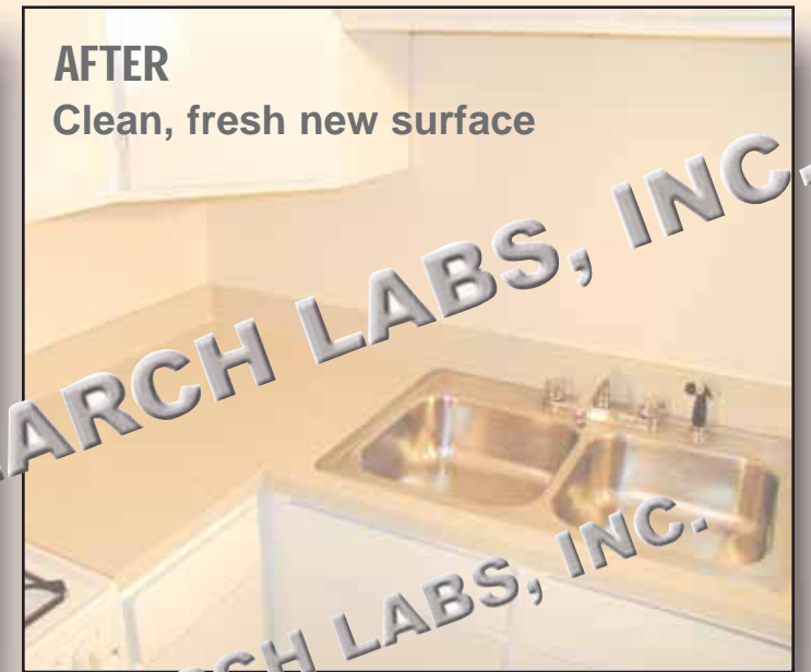
AFTER Clean, fresh new surface