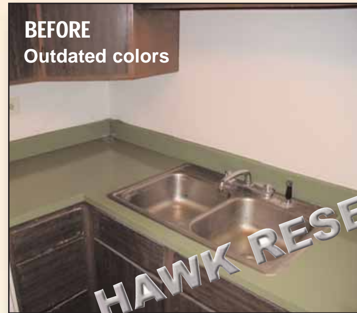
BEFORE Outdated colors

Another advantage of Stone-Flecks non-porous finish is that it is highly resistant to acids and stains. Plus, you will never have to recondition or seal with Stone-Flecks , unlike real stone surfaces. Stone-Flecks retains its natural luster and is simply cleaned with soap and water.